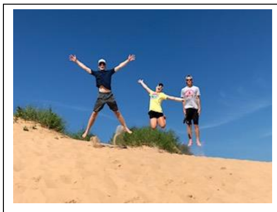
Julie's Vacation Photo of Jumping Kids