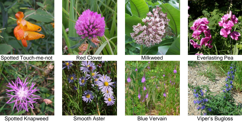
Spotted Touch-me-not Red Clover Milkweed Everlasting Pea Spotted Knapweed Smooth Aster Blue Vervain Viper's Bugloss