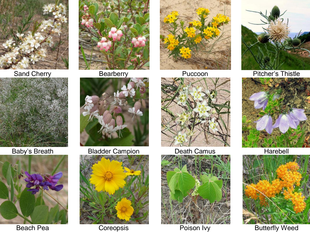
Sand Cherry Bearberry Puccoon Pitcher's Thistle Baby's Breath Bladder Campion Death Camus Harebell Beach Pea Coreopsis Poison Ivy Butterfly Weed