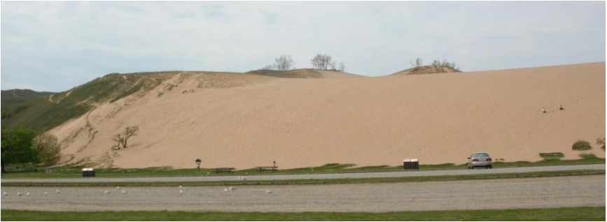
The Dune Climb (late fall). Notice the Cottonwood trees on the left and at the top of the dunes.

At the crest of the dune, you can see the tops of cottonwood trees, another stabilizer of the dunes.