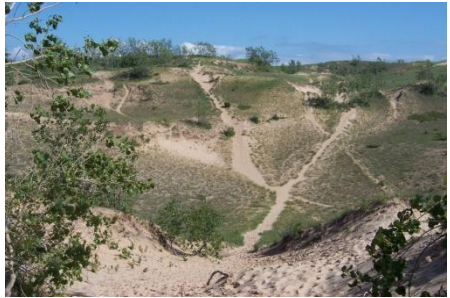
Trail from Dune Climb to Lake Michigan

If you are prepared for a strenuous hike, the 3.5 mile round trip walk up and down through the dunes to Lake Michigan will give you a good idea of the immensity of this perched dune area. Be sure to wear good shoes and take plenty of water.