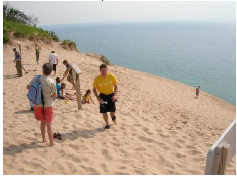
Perched Dunes at Lake Michigan Overlook

Some of the most prominent features in the park are the perched dunes. These are not ordinary beach dunes. They are high dunes perched on top of already high glacial moraines. The moraines are the great ridges of material that the glaciers pushed before them and then deposited when they halted and began to recede. As waves and wind along the lakeshore cut away the headlands of the glaciers, the wind blew the lighter sands higher up on top of the moraines. The heavier stones fell down toward the beach. This continual sifting process can be experienced on a windy day from the Lake Michigan overlook on the Pierce Stocking Scenic Drive. You will see and feel the sand blowing upward and you may carry some of it away in your eyes, ears and hair.