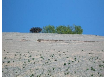
Lake Michigan Overlook on Pierce Stocking Drive looking up from the beach.

A lot of ice. Standing on the Lake Michigan beach at the base of the Sleeping Bear bluffs just north of North Bar Lake, you can look up to the observation deck on the Pierce Stocking Drive 450 feet above. During the last ice age the glaciers here were 7 to 10 times as high as those bluffs. The ice was a mile thick in some places!