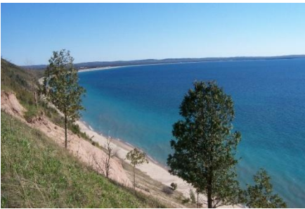
Lake Michigan from the top of a coastal bluff.

The Great Lakes basins filled with melt water as the glaciers receded. As the ice rapidly melted from the ice lobe in Sleeping Bear Bay it could not flow north because of the remaining glacial ice. A river carried this water south from present day Glen Lake, along where M-22 is now, around Empire and finally into the Lake Michigan Basin by Otter Creek. You can see this glacial drainage channel, which is now dry, as it crosses M-22 at Stormer Road just south of Empire. You will get an idea of the immense volume of melt water it once carried.