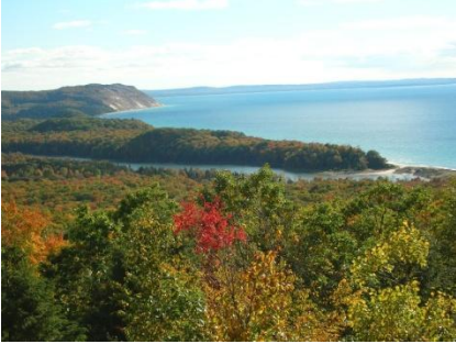
North Bar Lake and Empire Bluffs in the background as seen from Pierce Stocking Drive.

Follow M-22 into Empire past the junction with M-72 and when the road veers to the right, go straight on Lacore Street, and follow it to the end. Turn right on Voice Road, then left on Bar Lake Road until you arrive at the parking lot for North Bar Lake on your left. There is a vault toilet at the parking lot. Take the short hike to the lake and follow the boardwalk over the beach dunes to Lake Michigan.