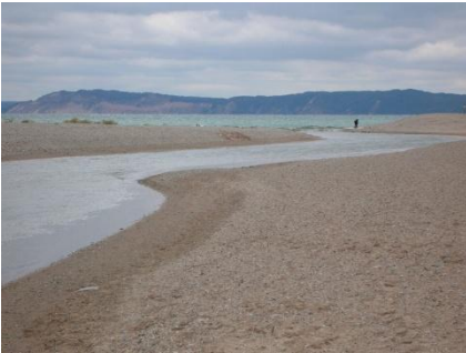
Platte River where it meets Lake Michigan. Note the sand barrier that directs the river parallel to the beach. Also note the coastal bluffs.

NOTICE: During the spring and early summer, part of this beach may be CLOSED to protect the nesting area of the Piping Plover, an endangered shore bird.