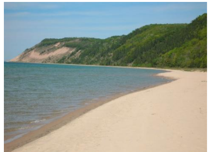
Coastal bluffs north of Esch Rd.

Glacial ice, like water, seeks valleys and lowlands. The front of the ice takes on a lobate shape as it conforms to the terrain. Imagine glacial ice twice as thick as the highest hills you can see. As the ice melted, the runoff waters carried sand and gravel that had been frozen into the ice. This debris was deposited between lobes of ice to form highlands. Looking north from Platte River Point, you can see two such highlands: Empire Bluffs and