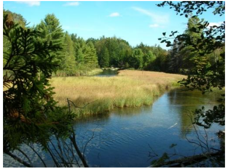
Crystal River from Dunn's Farm Rd.

Drive to Glen Arbor on M-109 until it connects up to M-22 again in town. Continue through town until you see the river on your right side. Turn right on Dunn's Farm Road and you will see glimpses of the river as it turns back on itself several times on it's way to Lake Michigan. The river drains water from Glen Lake following a tortuous path through the troughs between low sand ridges formed by the beaches of ancestral Lake Michigan as it receded.