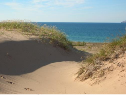
Coastal Dune on the Sleeping Bear Pt. Trail

the beach. It is only ½ mile to Lake Michigan if you take the spur trail to the Lake. Once on the beach, turn left and walk down to Sleeping Bear Point.