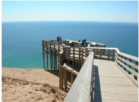
Lake Michigan Overlook on Pierce Stocking Drive

Continue along the Scenic Drive to Stop #9. Take the short walk to the observation deck of the Lake Michigan Overlook where you will see the beach 450 feet below. Notice the composition of the bluff below your feet. While many people assume this is a dune, you will notice the rocks and gravel mixed with sand which indicates it is a moraine created from debris pushed up by the action of the glaciers. On a