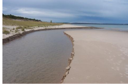
Otter Creek meets Lake Michigan at Esch Rd.

As you drive north along M-22 toward Empire, turn left onto Esch Road and drive to Lake Michigan. If you were unable to walk the beach at Platte Point, this is another good opportunity to see the bluffs that boarder Lake Michigan. Get out of the car and walk the short distance to the beach where Otter Creek empties into Lake Michigan. On a smaller scale than at the Platte River, you can see how the wave action affects the direction of the creek as it approaches Lake Michigan. This is a favorite place for families to enjoy the flowing, warm water of the creek and the waves of Lake Michigan. You can also see the formation of beach dunes as the wind blows the sand up from the beach into dunes stabilized by dune grass and other hardy plants.