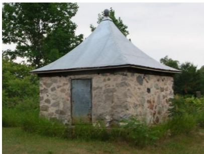
Kropp Smokehouse 2007