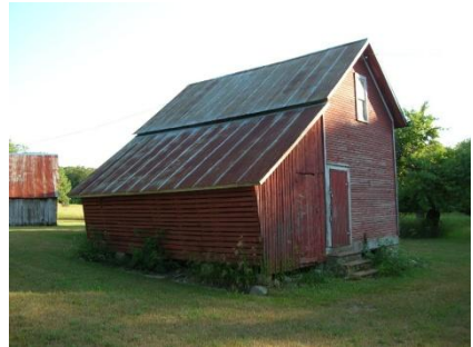
Bufka Granary 2007

The granary/storage shed area is actually three structures all adjoined. It was used to store corn and grain to feed the farm animals. Note that the granary was built on a foundation above ground level and was built tightly. This was to keep the mice and other rodents from easy access to the grain. Most of the grain was stored on the second floor in bins with chutes to the first floor where it could be put into buckets to feed the animals. There is a corn crib built onto the granary as a lean-to. The corn crib was built with slats spaced a couple of inches apart to allow the corn to dry.