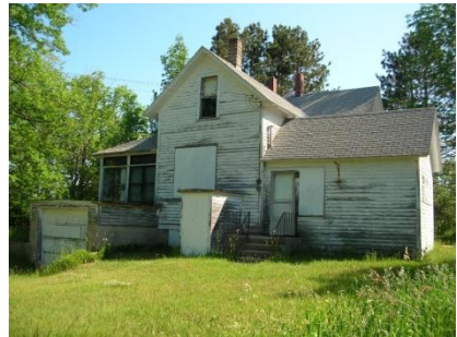
Kropp House 2007

The house was built around 1890. Its construction is similar to other farmhouses in the area – stone foundation, clapboard walls, and asphalt roof. It has two gabled wall dormers on the north side and three chimneys. Behind the house is a homemade circular clothes-drying rack made of metal and wood. There is also a shed and a privy near the house. If you walk along by the edge of the cemetery, you will also notice a couple of little shacks, which were probably used as workshops or to house small animals.