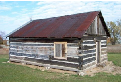
Shalda Cabin 2006