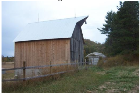
Treat Barn and garage 2007

The garage is the unique cement dome structure ahead of you and the little root cellar built into the hill near the garage also has a cement dome structure. The frame farmhouse has a great view of the fields from the front porch with an orchard behind it. Below the barn and garage are machine sheds for storing farm equipment.