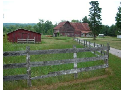
Eitzen horse barn and barn 2007

The barn, built around 1890, was set up for a small dairy operation. There were probably two alterations in 1926 and 1945 for milking. The cow stalls and stanchions (part of the stalls that latch around the cow's neck to keep her in place during milking) are still in the barn. The silo (built ca. 1910) had a poured concrete foundation and was made from tiles mortared together with an octagon