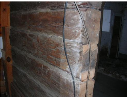
Kraitz cabin interior log wall 2007