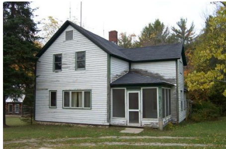
Bufka house 2007