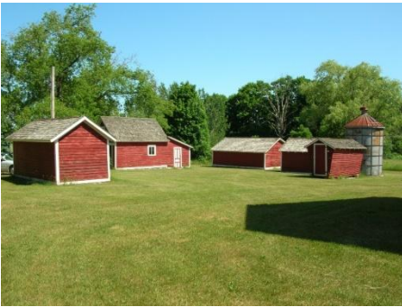
Tweddle Farm outbuildings 2007

The buildings are typical of small family farms. The barn was used for dairy cattle in the bottom level with hay storage above. The metal silo near the barn was used for silage (chopped corn or hay that was stored wet and fermented over time). The other smaller silo may have been used to store dry grains. There are also several smaller buildings: a corn crib, granary, chicken coop, pump house, etc.