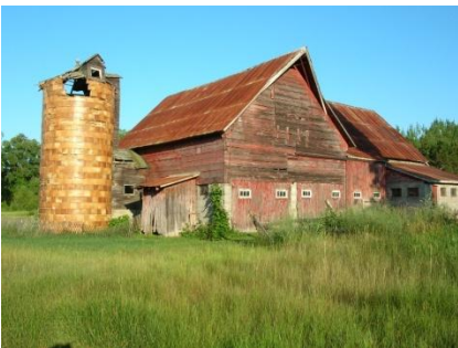
Eitzen barn and silo 2006