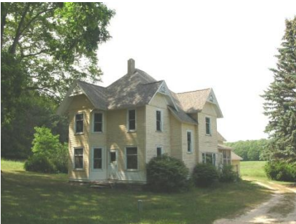
Esch Farm House 2007

Are you ready to head to Aral? Drive back out to M-22 and then go north 8.5 miles to Esch Road. Turn west and go about ¼ mile to the Esch house on the north side of the road. This Victorian house was built around 1890 as part of a farmstead that provided livestock, dairy, and fruit to the inhabitants of Aral. The barn and other out-buildings have been removed, and the house is now used for housing for Lakeshore staff.