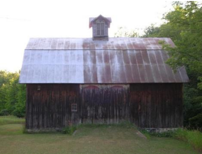
Bufka Barn 2007

The barn was built in 1908. Its construction is typical of barns in this area with a stone foundation, vertical board siding, and a wooden shingle roof. It is 24 feet by 36 feet with heavy hewn mortise and tenon frame. The gambrel roof has a large center ridge and a cross-gabled cupola with shutter vents adds character. The barn is built on a sloping hill so you could enter the upper floor on ground level to unload hay and the lower floor where the dairy cows, horses, and pigs were housed is accessible at ground level around to the north side where the ground sloped down to the swamp. The upper floor had a hay sling on a pulley system that was used to stack hay in the higher part of the hay mow. A team of horses or later a tractor was used to lift the hay from the wagon to the top of the mow. Hay was raked into furrows and then pitched by hand onto the wagon until the 1950s when they hired a neighbor to bale the hay.