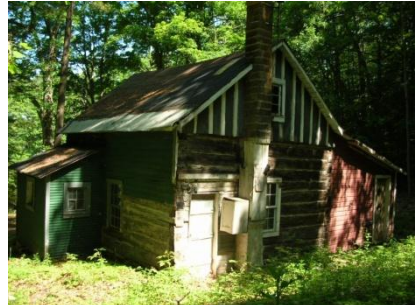
Kraitz cabin from behind 2007

The cabin was built approximately 1856. It was the first permanent dwelling built on the Francis Kraitz homestead, which is about one mile further south on CR-669. The homestead is on the west side of the road across from the St. Joseph Catholic Church on top of the hill. Because the family story is typical of many early settlers in North Unity, it will be described in some detail.