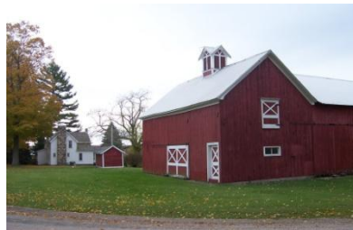
Tweddle House and Barn 2006

Drive west on Norconk Road for about ½ mile. The road will turn south and on the corner is the Tweddle Farmstead. Park your car at the corner and walk around the barn and outbuildings. This picturesque farm was home to the Tweddle family. David Tweddle homesteaded this farm in 1867 and received the patent for the land in 1873.