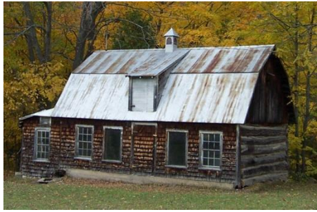
Bufka original cabin and now chicken coop

The garage was originally built in the 1920s as a 2-bay garage, and the other two bays were added in the 1960s. The log chicken coop is believed to be the original log cabin the Bergman family built on the homestead. The modification to make it into a chicken coop was done around 1940. The logs are visible on the east and north sides of the building.