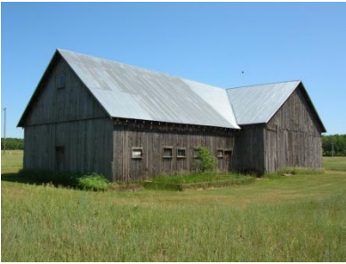
Pelky Barn from behind 2007

The barn next door to the school is the Pelky barn. It was built about 1875, and is the only building of the farmstead remaining. The L-plan, timber-frame, and vertical board siding is typical of barns of northern Michigan.