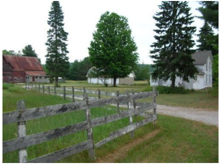
Eitzen Farm 2007

The house was built by John Eitzen about 1890 with an enclosed porch off the kitchen in the rear. The foundation is made of fieldstone and clay. The main entrance to the house opens into the back yard and faces the barn providing efficiency. The layout of the buildings with all the buildings facing a central yard indicates the focus of the family was the farm activities in the barns and workshop. The circular drive allowed trucks and field equipment to drive through. The house was a place to eat – the kitchen was right inside the back door.