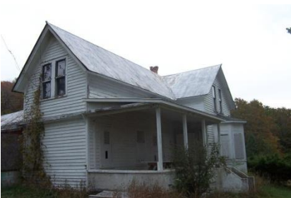
Treat House 2006