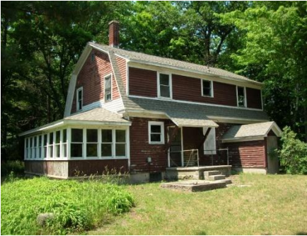
Ken-Tuck-U-Inn from the back yard.