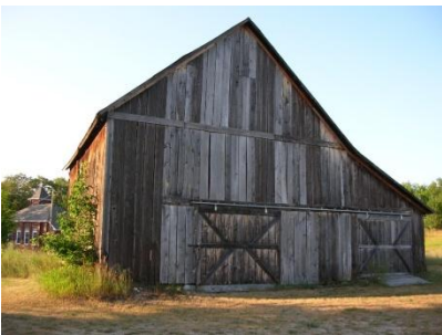
Kropp Granary 2007

Now we're ready to go to our last farm on the tour. You don't have far to go, because the Kropp farm is right on the corner of M-22 and Townline Road. As you drive back to M-22 from the Eitzen farm, turn into the driveway just before you get to the St. Paul's Lutheran Church. The land where the church building and cemetery are located were donated by the Kropp family, and several of the family members are buried in the cemetery. The Kropp farm is missing a large barn and possibly some other buildings from the original farm. The remaining buildings are now divided by the church grounds, so let's look at a couple of buildings on the south side of the church and then go over to the house on the east side.