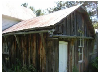
Treat rain-water system 2007

A major problem for the Treat family was the lack of running water at the farm. They hired a contractor to drill a well. He worked at it for over a year, and found that he had to go down about 300 feet to find water. In a short time the well clogged with sand, so a series of gutters was added to the roof of the house to drain rain water into a cistern built into the ground. This system of rain water collection can be seen today as you walk to the rear of the house. The kitchen