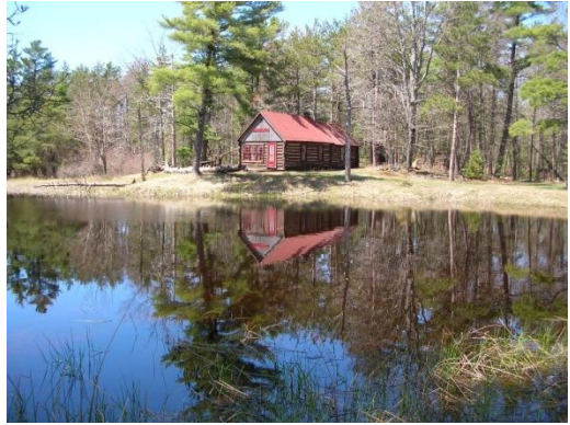
Boekeloo Lodge 2007

The pond is actually a cranberry bog dug out by Boekeloo in the late 1940s. They dug a canal to the Platte River to fill the bog. There are no cranberries any more, but there is still evidence of the canal. The lodge was built as a homestead cabin by the Cooper family, who hunted, trapped, fished, and tended a garden to survive on the sandy soil of Platte Plains from 1932 to 1935.