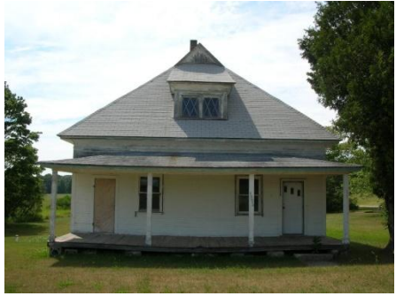
Tweddle School 2007

Drive back to M-22 and head north for 2.1 miles to Norconk Road and turn west. The Tweddle School is on the southwest corner of this intersection. It was built in about 1895 and served the little farming community until the schools were consolidated and the building was converted to a residence. The bell tower was removed, but the exterior of the building displays much of its original character as a school. Note the two entrances: one for boys and one for girls. A row of lilac bushes borders the school yard.