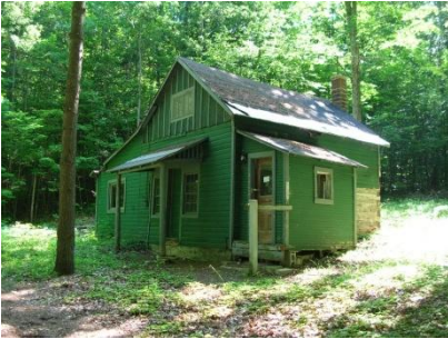
Kraitz cabin from the driveway 2007

Let's go back to the car for a short ride to an interesting little log cabin that was hidden in plain sight. Turn south on CR-669 and drive 0.8 miles. Look for a little green cottage on your left (east) setting about 100 feet from the road. This is known as the Kraitz cabin. The cabin looked like a 1940s era cottage. When the Park Service took ownership and began to inspect the building, they found a very well preserved hewn-log cabin underneath the clapboard siding!