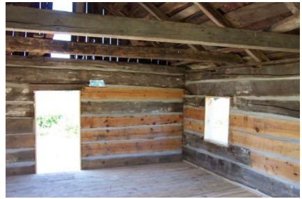
Inside the Shalda Cabin during restoration

This cabin was in poor condition when the Lakeshore obtained the property. It was surrounded by brush and weeds and the lower logs were rotted. Significant reconstruction work has been done to restore the cabin to its current condition. The cabin shows early log construction techniques of the Czech and German immigrants who settled in North Unity and Shalda Corners. They had brought methodology for building cabins from hand-hewn timbers from their native Black Forest of Central Europe. Note the dovetail notched corners of the logs.