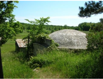
Treat Garage from walkway to the house 2007

The original front porch of the house was removed and rebuilt with a concrete foundation. This design allowed a basement workshop to be built under the porch. A forge was also added under the porch with a vent to a metal smokestack located off the wood shed. The forge was used to make metal hinges and tools for woodworking. Most of these parts were for family use, not for sale. Some of the tools are preserved at the Empire Area Museum.